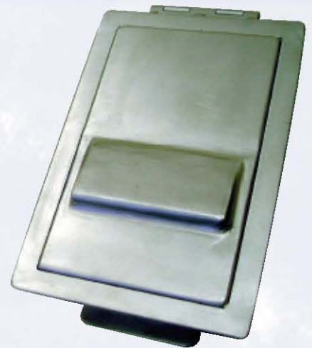
Single Tapered Step

Powerful, dependable magnetic protection against the dangers of fine iron and tramp iron contamination.