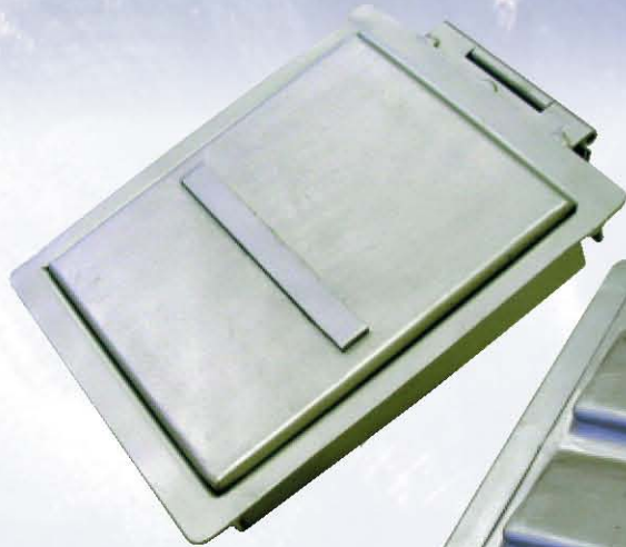
Standard Barrier Strip