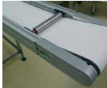
Internal belt return rollers

Compare our prices: 1200mm long x 400mm wide conveyor from ONLY $3200.00 + gst Includes internal drive motor , single phase Variable speed drive, White PVC Belt.