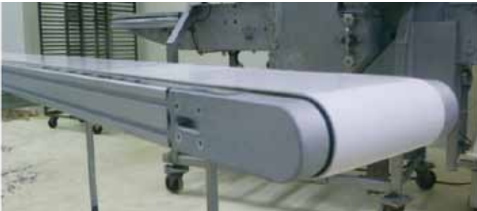
Underside of conveyor frame is totally free of sagging belt

An excellent feature of our Alupro conveyors is our optional internal belt return. By using our specially designed clips we are able to add internal return rollers for guiding the belt inside the frame on the underside of the conveyor. This creates a very tidy conveyor that enables mounting directly to a flat surface or permits guarding to the underside if operators have to work under the belt. Talk to us about your custom requirements as the Alupro system is simple to customise for many applications.